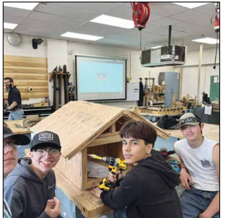
Carmel High School students work on a shed to house a defibrillator. A shed on the fields at GFMS holds an AED in case of an emergency.