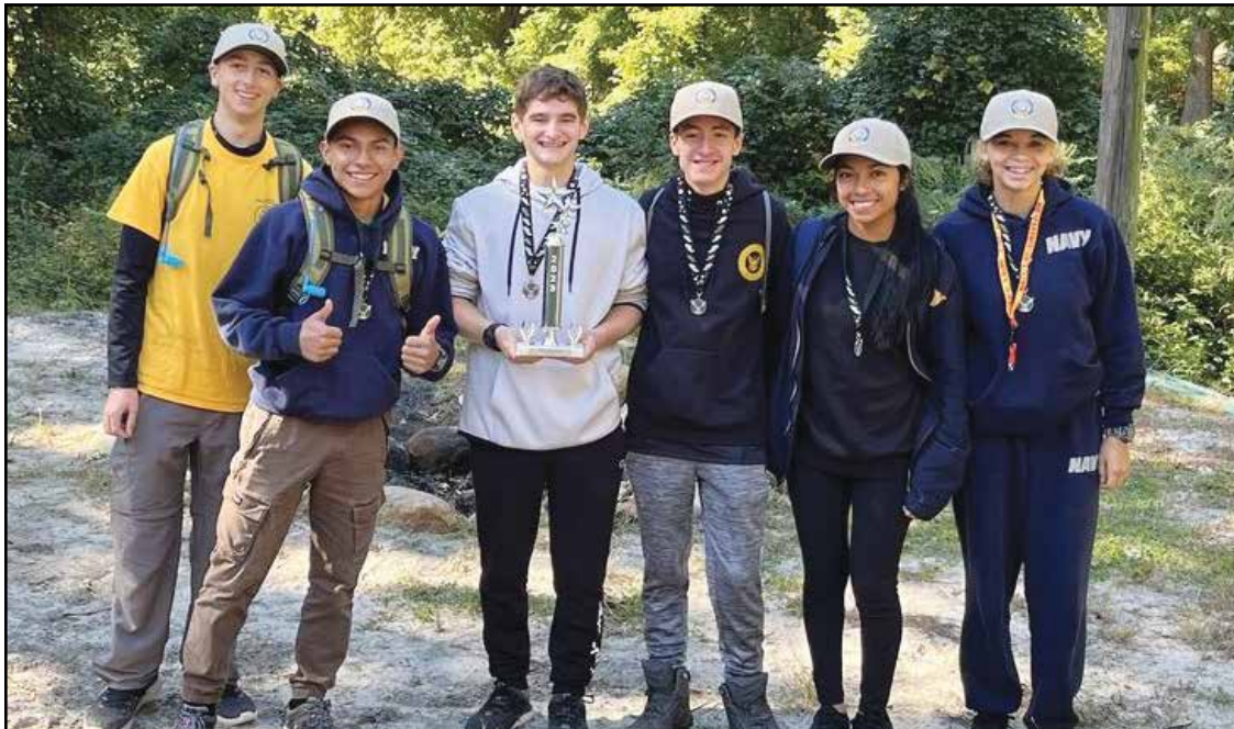
Members of the Brewster NJROTC who placed first at a recent orienteering meet in Long Island.