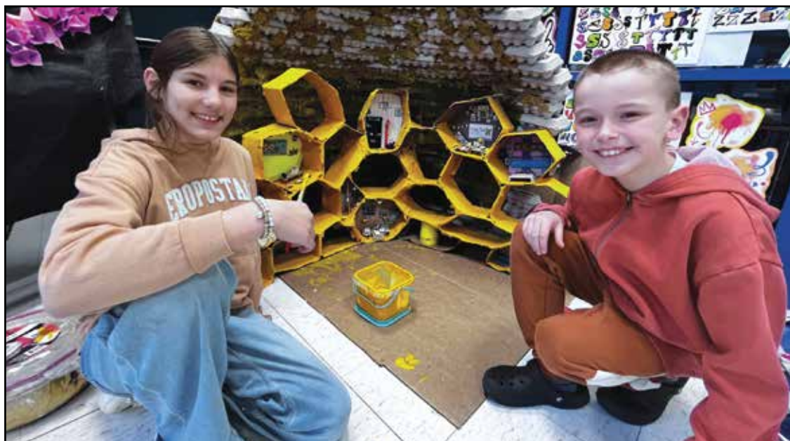
Olympics of Visual Arts students in Brewster have been busy creating various projects in anticipation of an Olympics-style event at the end of April that will take place in Saratoga Springs. Here, a biomorphic classroom – a bee hive made of egg cartons – features cells that each contain a different classroom for bees.