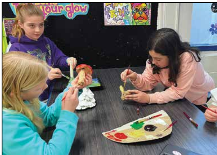
Painting, gluing, and constructing is all part of the program.

The biomorphic classroom is a bee hive made of egg cartons – a bit like a cave – with cells that each contain a different classroom for bees: a music room, a library,