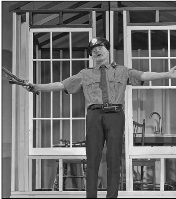
Members of Brewster Theater Company rehearse for "Middletown."

Middletown, USA. It's anywhere, everywhere.