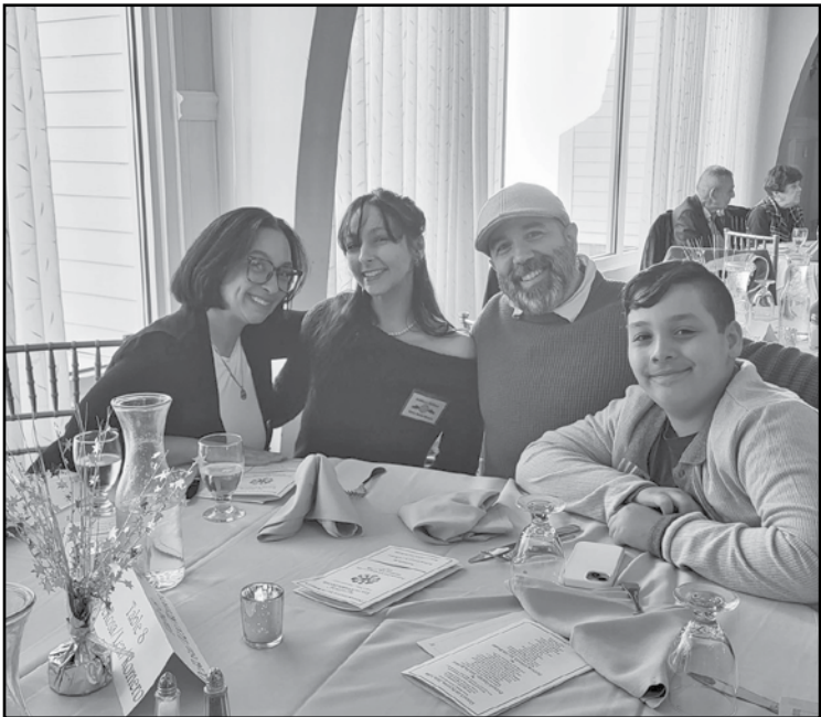
Fifteen high school students and three adults were honored at this year's Youth Awards Dinner at Putnam County Golf Course in Mahopac for their community service.