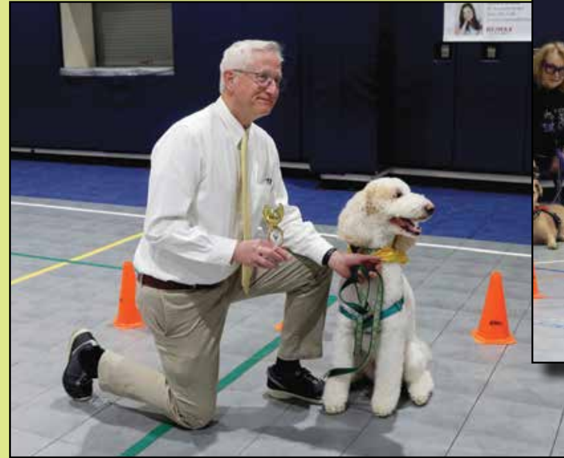
Putnam Service Dogs hosted its annual Funminster on April 11 at the Patterson Recreation Center. Awards were presented for best wiggle butt, shaggiest coat, dog/owner look-alike, best senior, best dressed, best tail, best ears, most talented, and largest and smallest dog. Congratulations to all the winners!