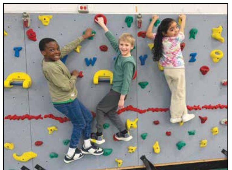
Students participate in heart-healthy activities during physical education class.

Students at JFK Elementary School in Brewster raised a total of $21,450 this year for the American Heart Association's Kids Heart Challenge – the highest amount in the school's history.