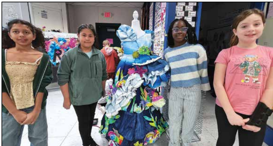
Fifth-graders affixed neon-colored fish to a gown they sewed, and when you shine a black light on the features, they glow.

Hot glue guns, papier mache strips, Mod Podge containers, and Model Magic are the accoutrement of Olympics of Visual Arts students in Brewster.