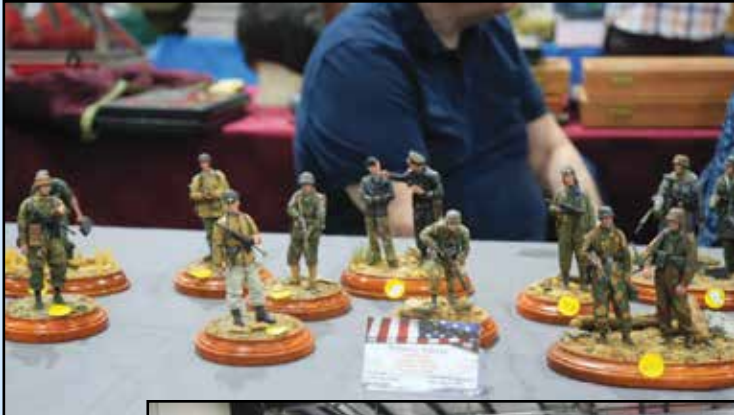
The Duffel Bag in Patterson hosted another Militaria & Knife Collector Show on April 18 at the Patterson Recreation Center. Insignia, uniforms, weaponry, models, and more were on display for history buffs to peruse.