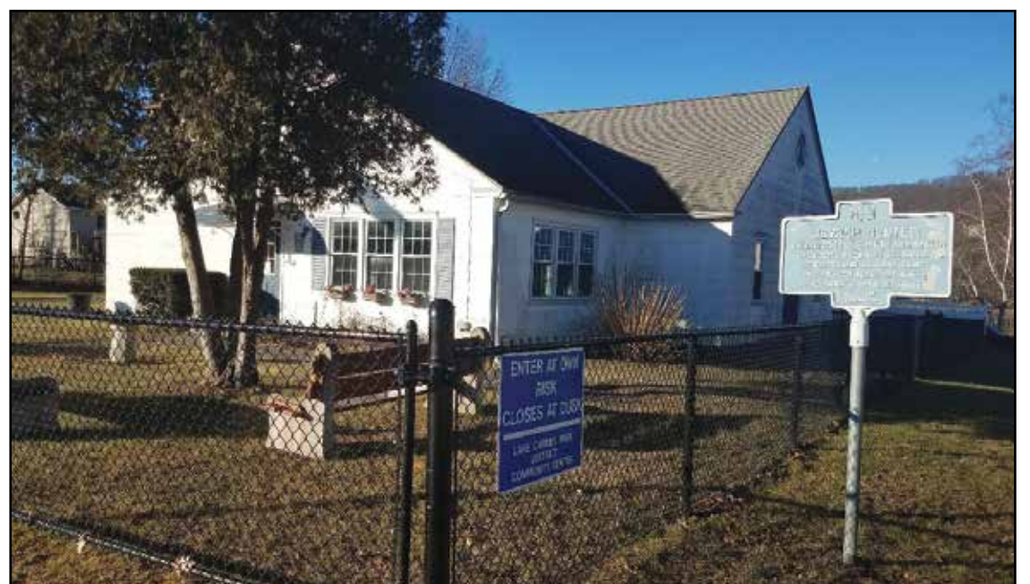
The Lake Carmel Community Center, located at 10 Huguenot Road.