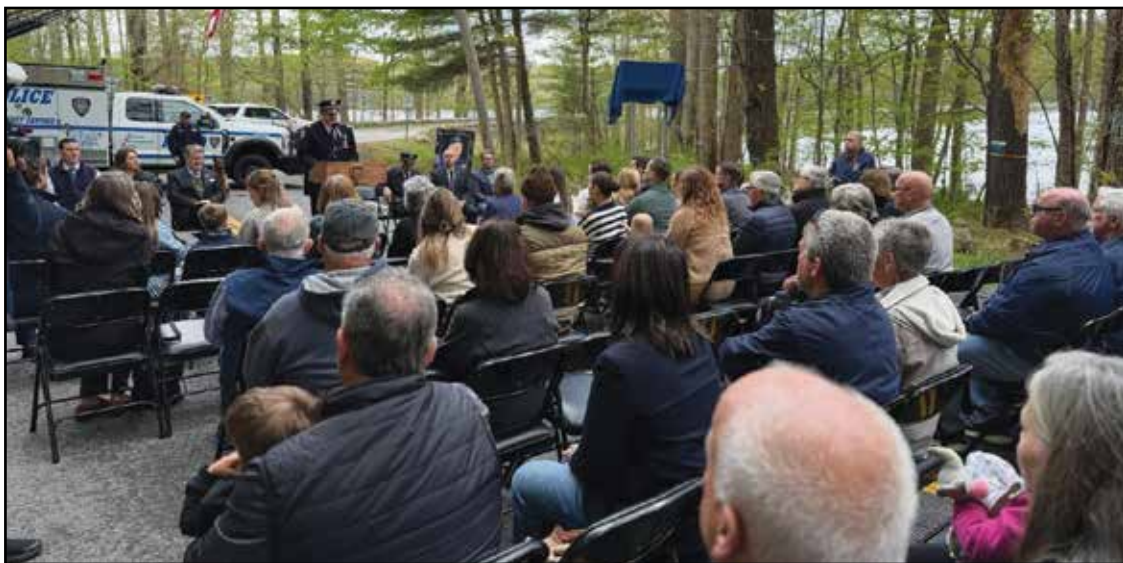
Many law enforcement officers assembled May 2 along Route 301 in Carmel for the unveiling.