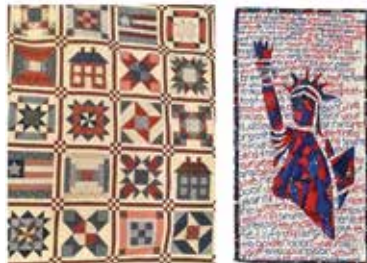
Quilts by the Northern Star and Butterfly Quilters groups.

together for years on quilting projects for the community, meeting weekly on Tuesday mornings at the library.