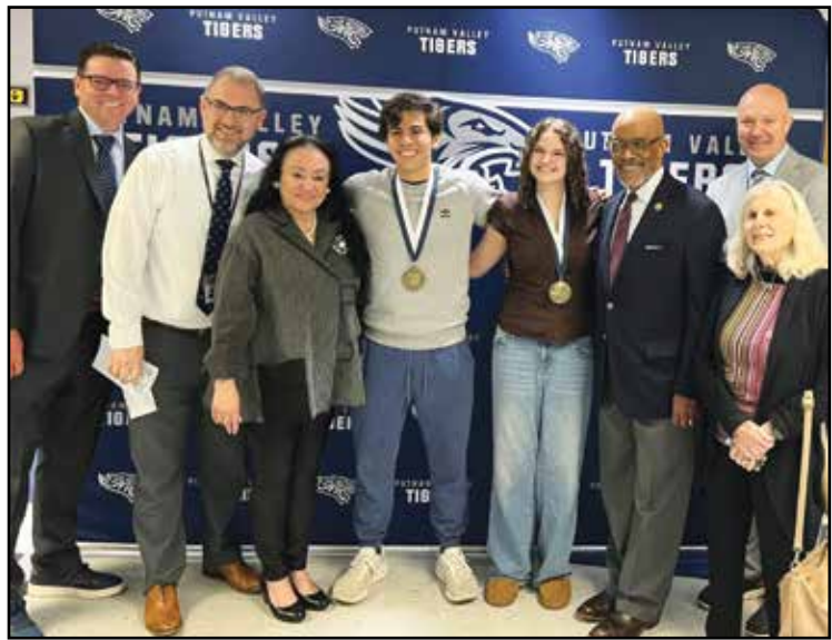
New York State Education Department representatives with the Putnam Valley Class of 2026 valedictorian and salutatorian.