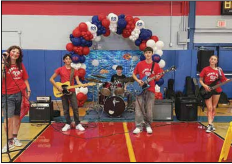
The Carmel High School Homecoming Band.