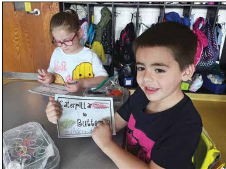
JFK students are journaling what they observe of the caterpillars' life cycle.

Recently, the caterpillars arrived in boxes and were unveiled in various ways by teachers – and the anticipation and excitement was real. Predictions of what were in the boxes ranged from tarantulas to ladybugs.