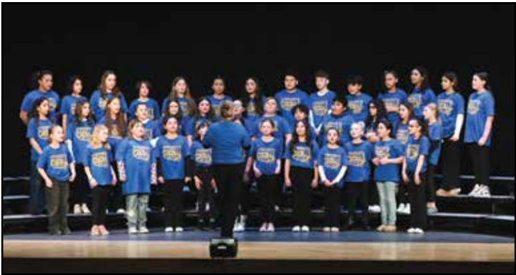
Students perform during the Mahopac Choral Festival.